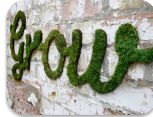
Art -pop up installations