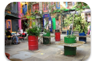
40 gallon upcycle