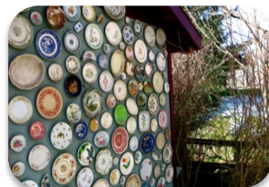
Wall of plates