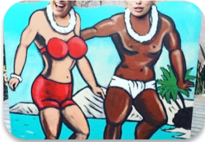
Artists interactive boards