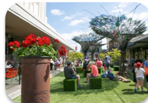
Pop up options