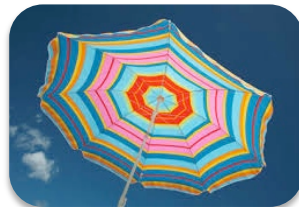
Brollies for hire