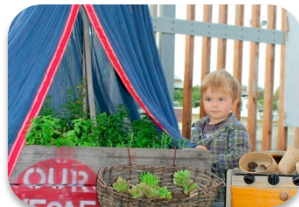
Herb boxes for children