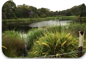
Signs to wetlands