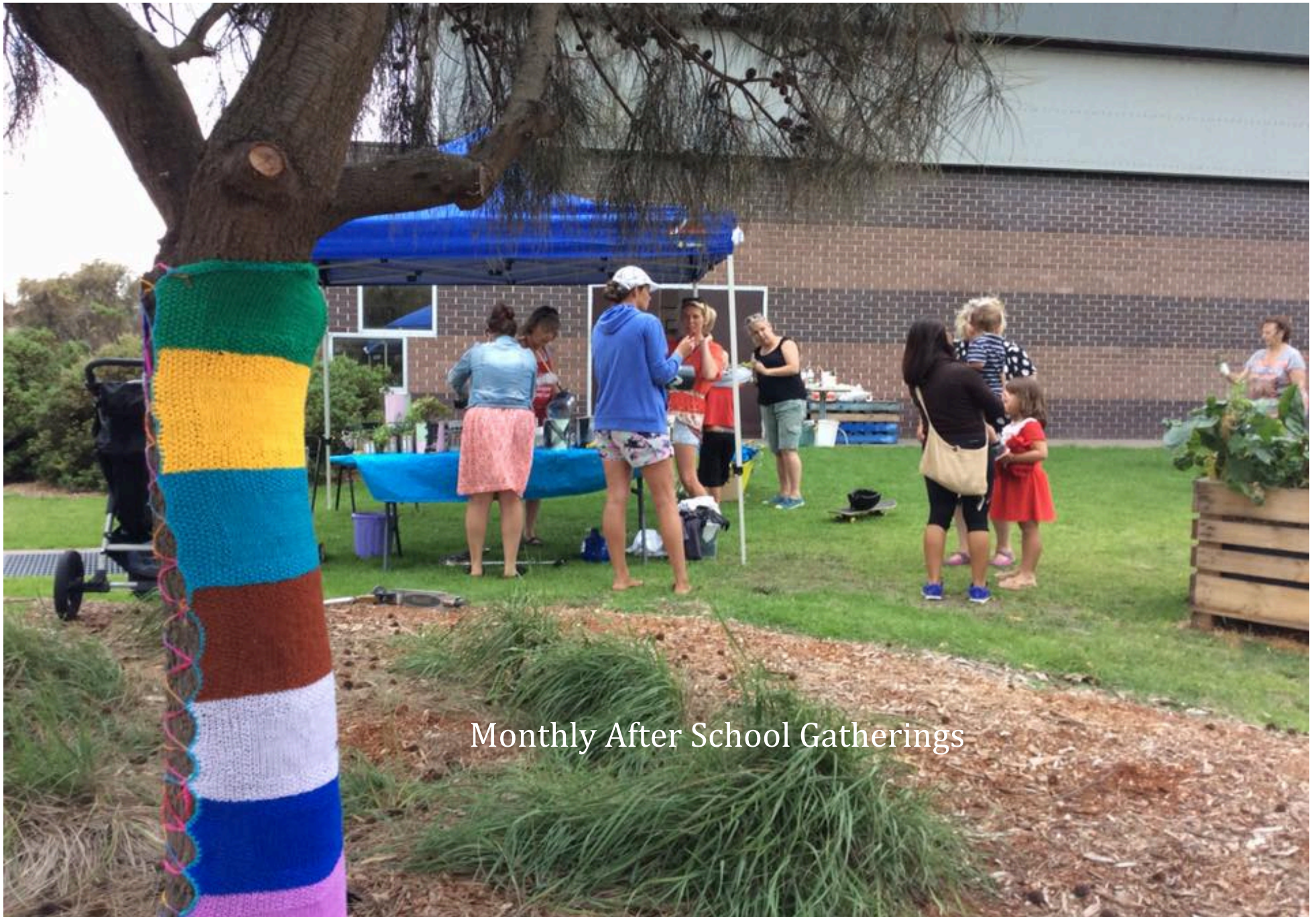
Monthly After School Gatherings