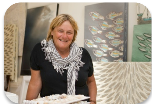
Local artist working with youth